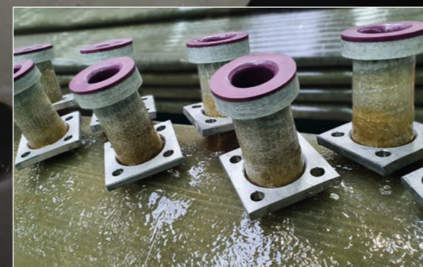
Dekadur Plus header for use in chlorine-alkali electrolysis processes.