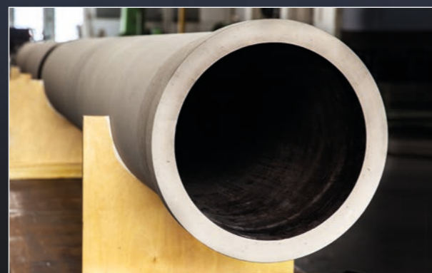
Stable, self-supporting pipelines made from KERA® with maximum chemical resistance.